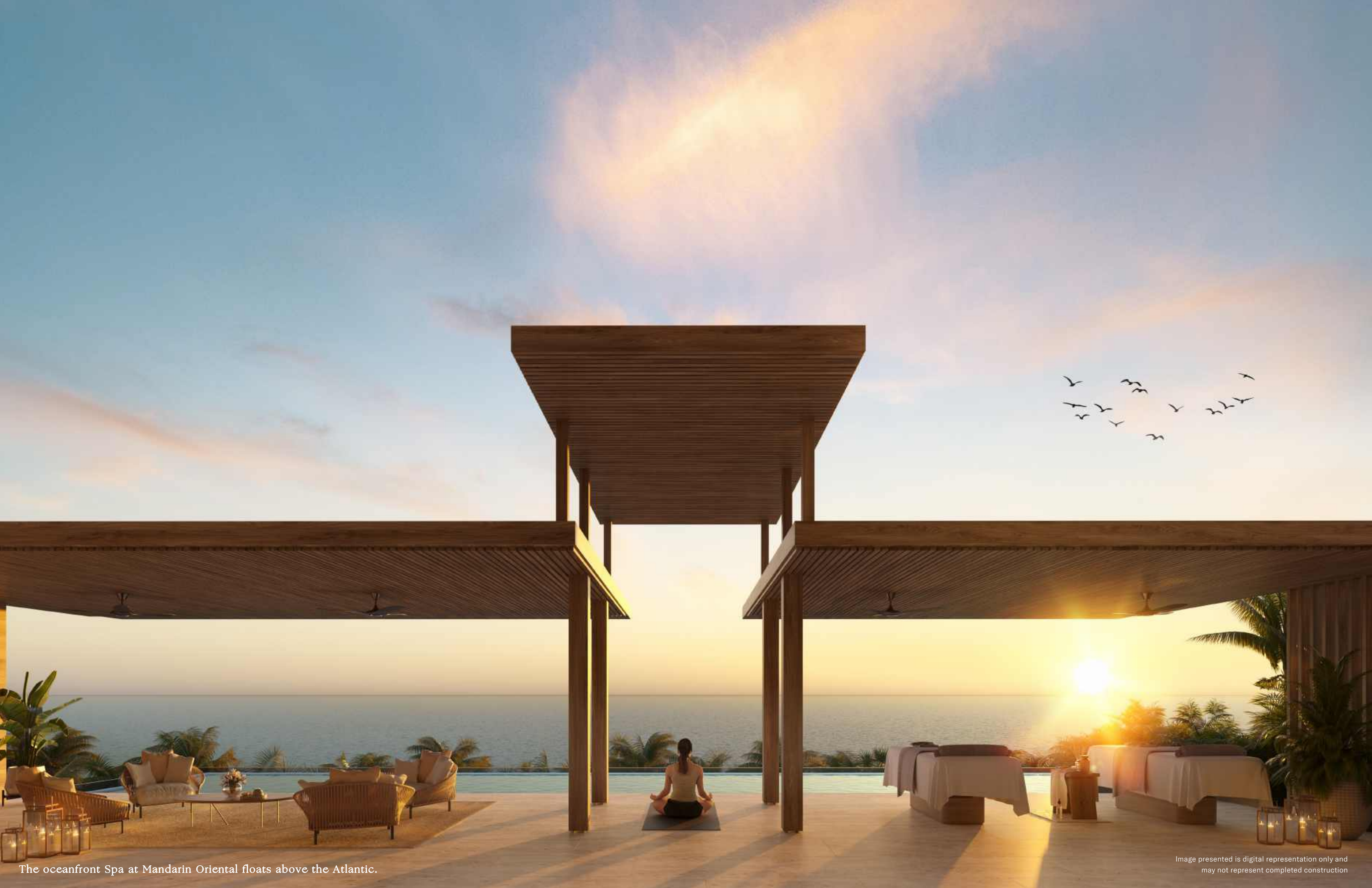
The oceanfront Spa at Mandarin Oriental floats above the Atlantic.