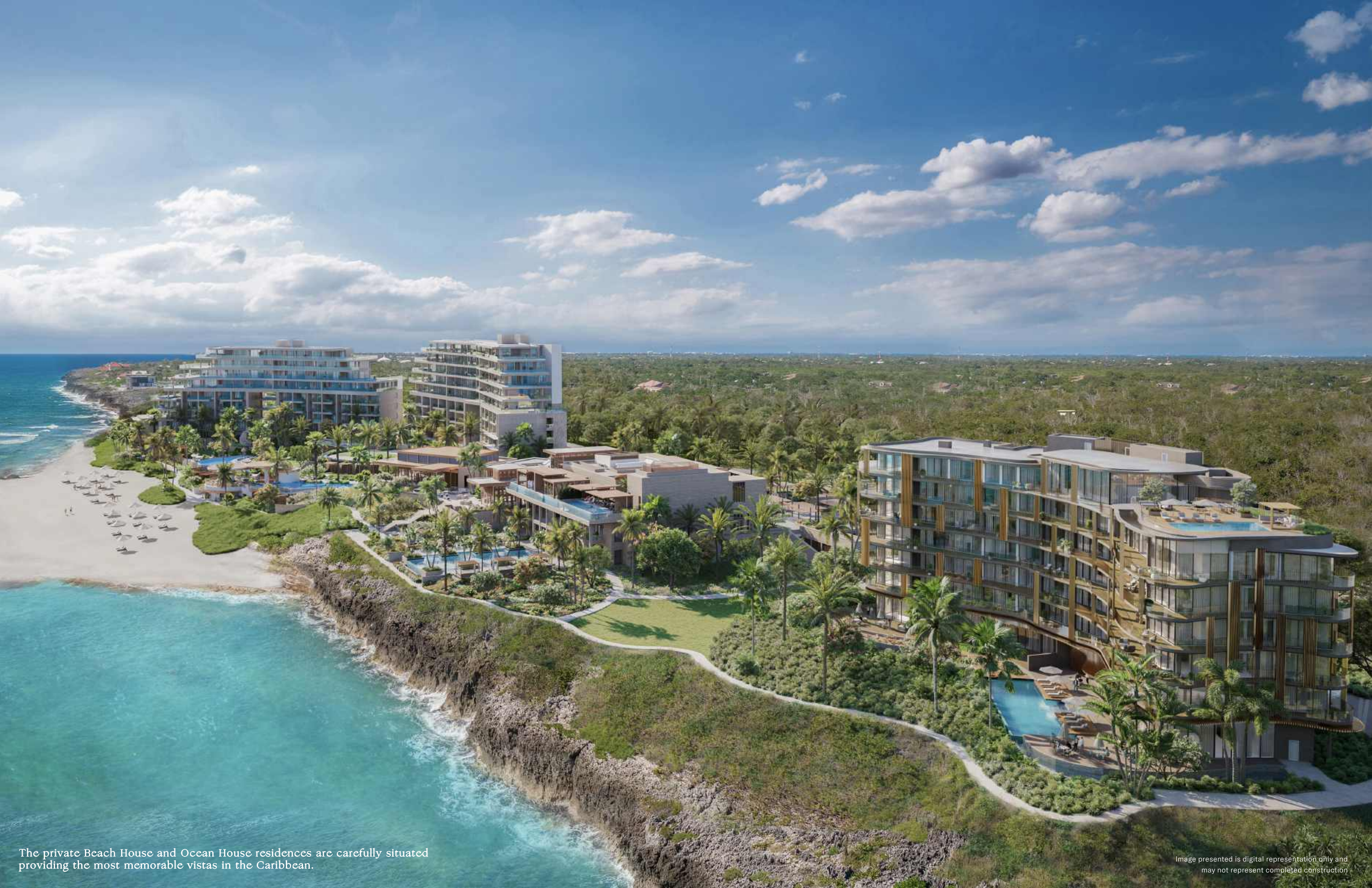
The private Beach House and Ocean House residences are carefully situated providing the most memorable vistas in the Caribbean.