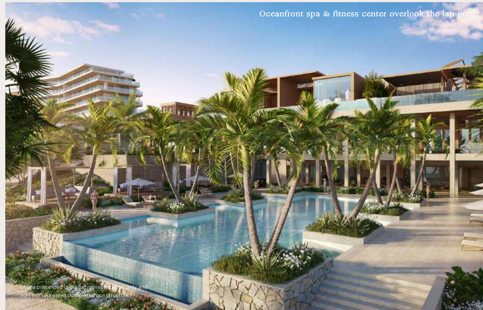
Oceanfront spa & fitness center overlook the lap pool

Image presented is digital representation only and may not represent completed construction