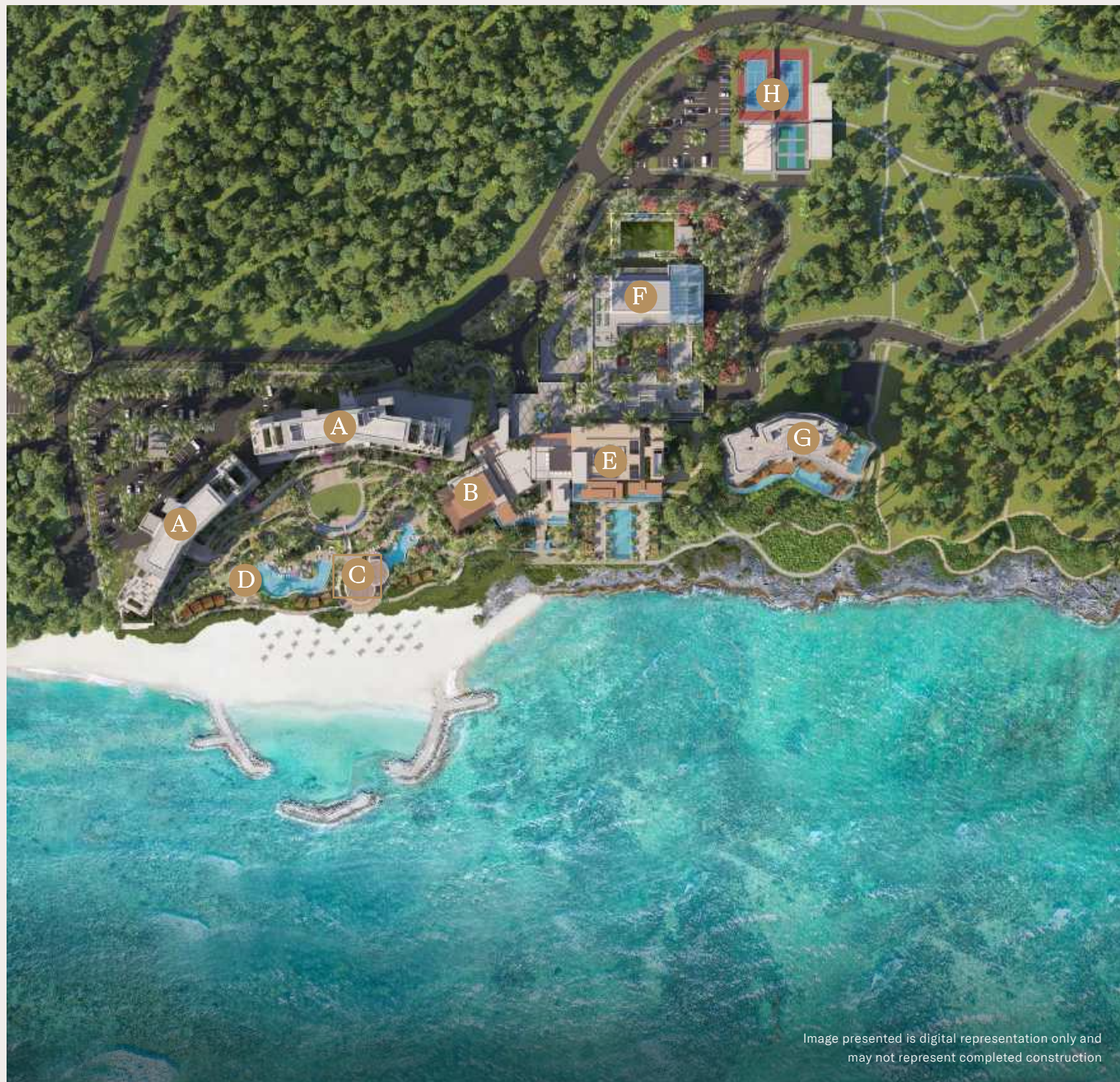
Image presented is digital representation only and may not represent completed construction